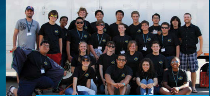
2011 Pacific Crest Drum Major Camp Attendees.

One of two new programs, the three-day Drum Major Camp brought together 23 Drum Majors from Southern California and Texas. The camp focused on developing conducting and leadership skills, and the students worked with local college professors, high school band directors, and past drum corps drum majors.